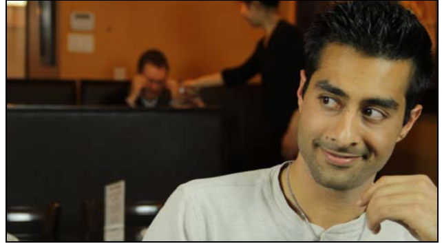
Karim, influenced by existentialism and Albert Camus's idea of the absurd, thinking Joe has to embrace death instead of seeing it as a bad thing.